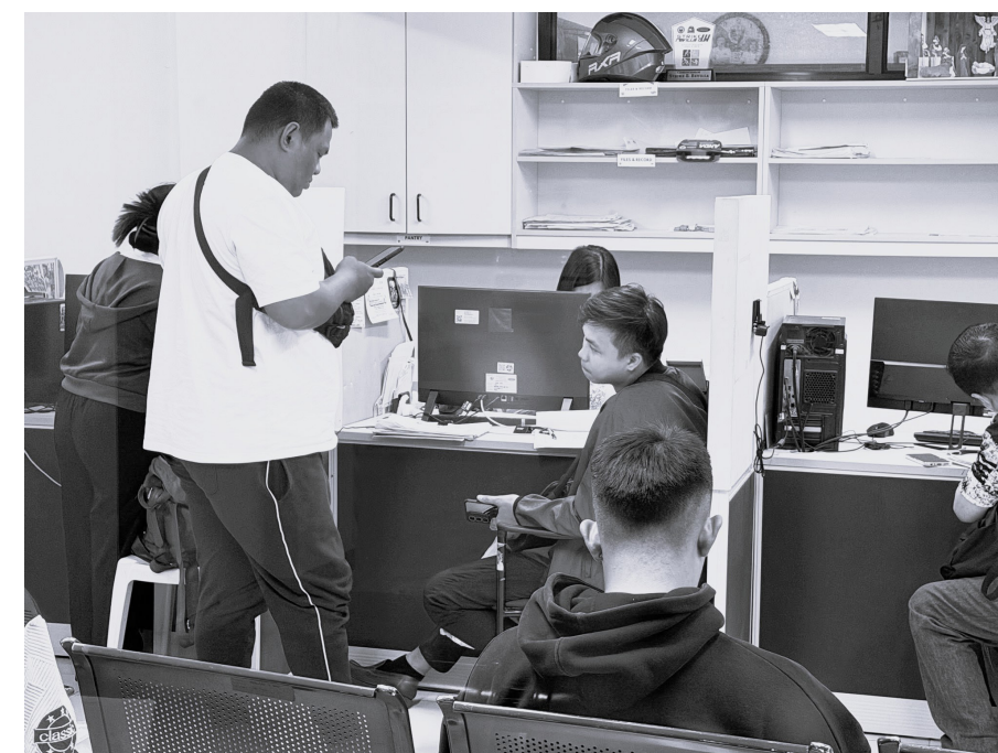
Bukas sila Monday to Friday ( 8am to 5pm ) sa Bacoor Government Center ( BGC ).

The Department of Foreign Affairs, through the Office of Cultural Diplomacy (OCD), reaffirmed its commitment to promoting Philippine textiles as instruments of cultural diplomacy during the Opening Ceremony of the 2026 National Textile Convention (TELACON), at the Philippine International Convention Center in Pasay City.